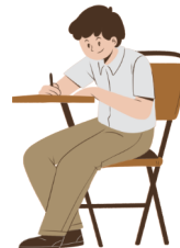
INDIVIDUAL & GROUP BASED PROJECTS