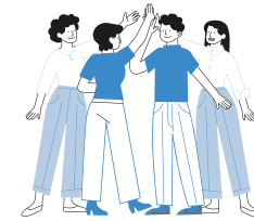
COLLABORATIVE & INTERACTIVE LEARNING