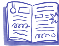
TUTOR-LED PHYSICAL CLASSES